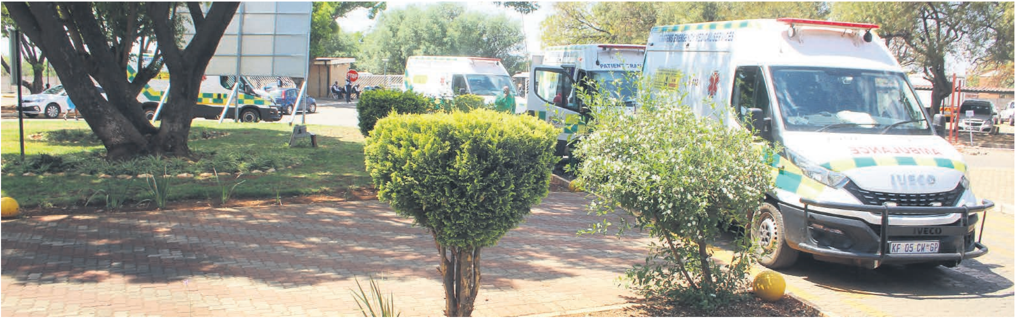
The sick girls were transported to Carletonville Hospital in seven Gauteng EMS ambulances. This photo was taken shortly after the girls were dropped off.