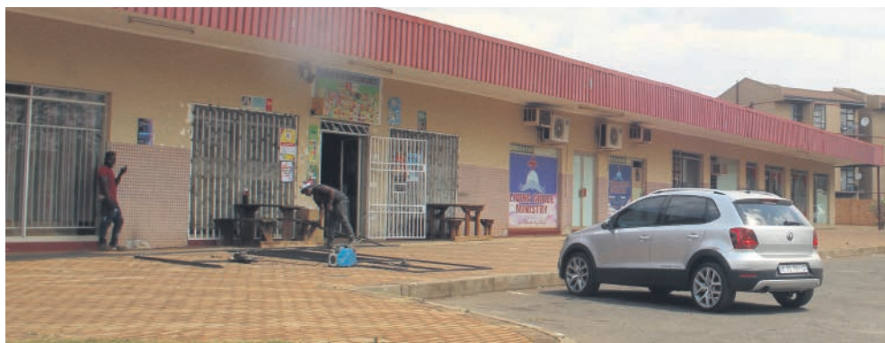
The area where the robbery took place.

Residents must still be on the lookout for people coming to them at ATMs and pretending to want to help them, as they can also gain access to your particulars and steal your money.