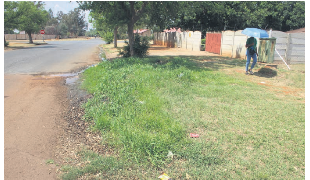
A pedestrian walks past the water leak in Kaolin Street.