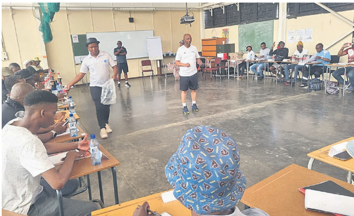
Many coaches have been taking part in the training sessions during the past weeks.