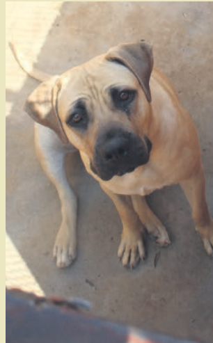
This gorgeous Boerboel is looking for a new family.