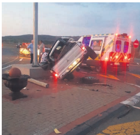
The scene of the accident.