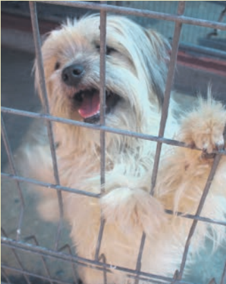
This lovely little Maltese cross called Max also needs a new family.