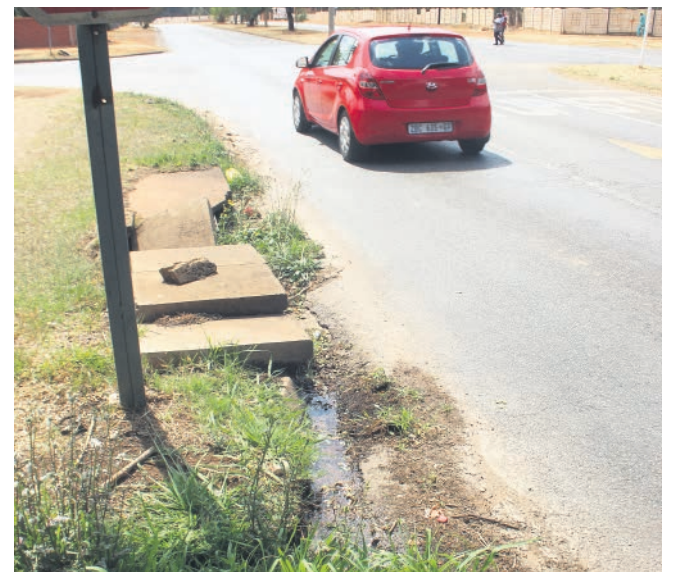
The ongoing water leak near the four-way stop in Agnew Road.

Skillfull Accredited Occupational Health & Safety Training