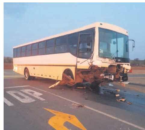
The bus that was involved in the accident.