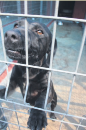
This beautiful and very friendly dog must also be adopted.