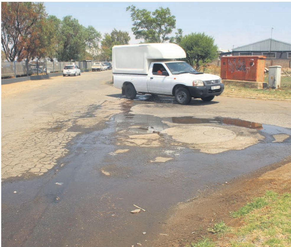
A bakkie driving over the sewage leak in Potchefstroom Street.