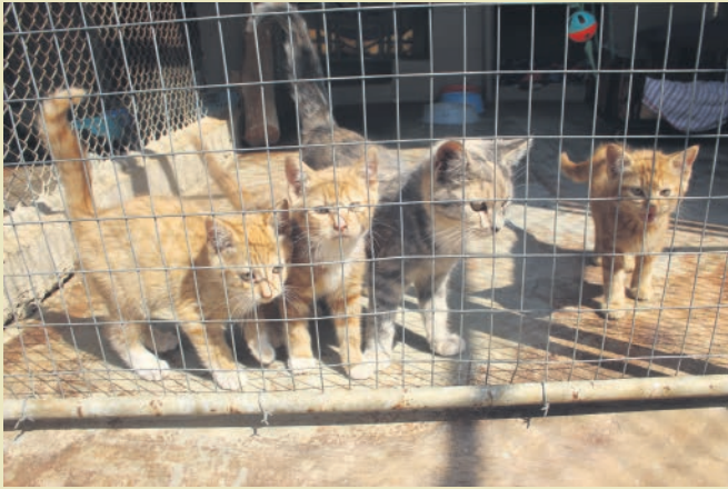
There are currently many beautiful cats such as these kittens that are looking for new homes at the Carletonville SPCA.

For more information, contact 018 788 6262. The emergency number is 064 752 6035.