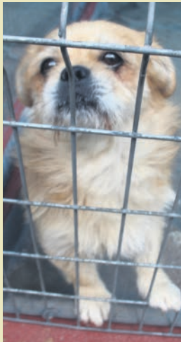
This lovely little Pekingese cross is also looking for a new home.