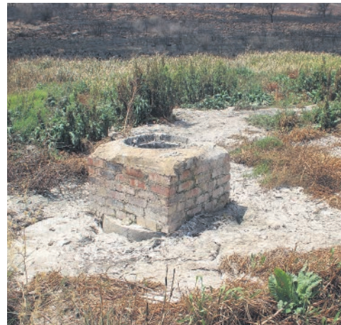
Some of the sewage that leaked from the manhole in the veld next to Populier Street.

Although the Herald asked the municipality about the matter on Monday, no answers were received.