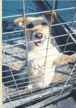
This friendly little dog needs a new home.