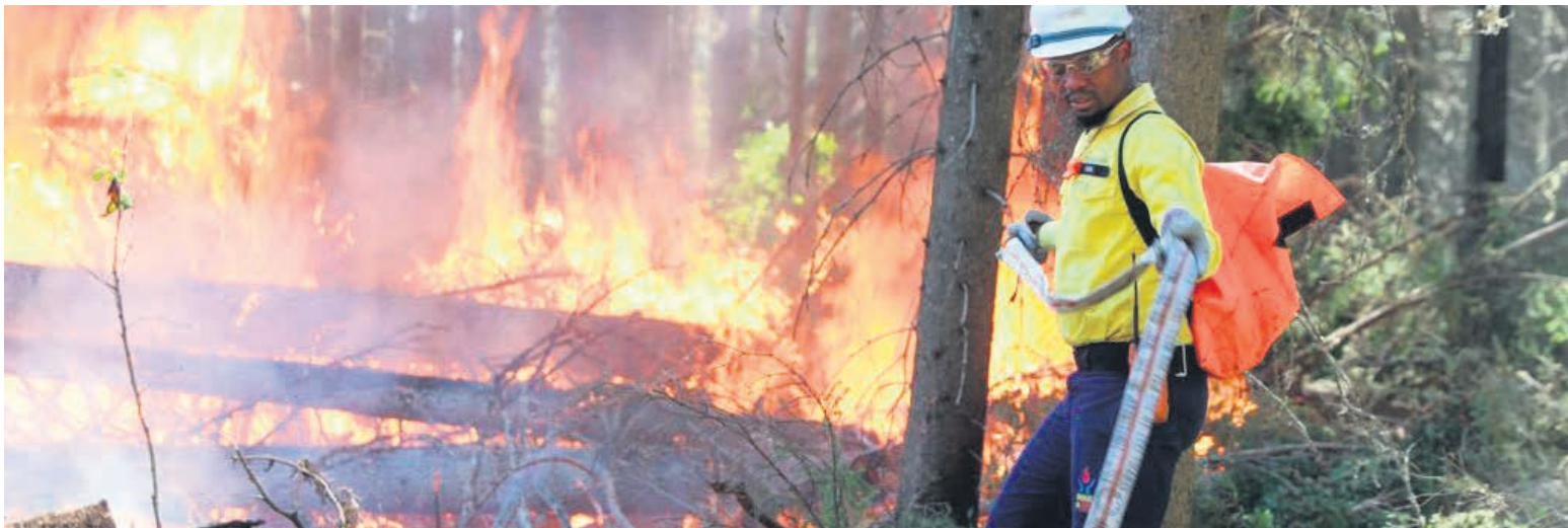
A firefighter in action who is part of the dedicated team from Working on Fire-Kishugu Joint Venture battles a wildfire in the West Rand, showcasing their commitment to protecting our land.