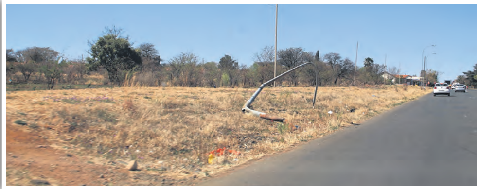
Met van die bestuurders wat op ons paaie te sien is, is dit nie vreemd dat daar al meer stukkende lammppale langs ons paaie lê nie. Dié paal het buite Fochville gesneuwel.

wanneer hy van al die aanvalle en diefstalle lees wat met tye in dié area gebeur. Die feit dat die steeg net agter die biblioteek ook 'n uithangplek vir haweloses en straatkinders is, maak alles net meer onveilig. Ons kan ook nie van ons kinders verwag om op te hou lees en leer net omdat die polisie en ander wetstoepassers nie hul werk behoorlik doen nie, kan ons? Of gaan daar 'n spesiale rak met boeke om jouself te verdedig naby die biblioteek se deur opgesit