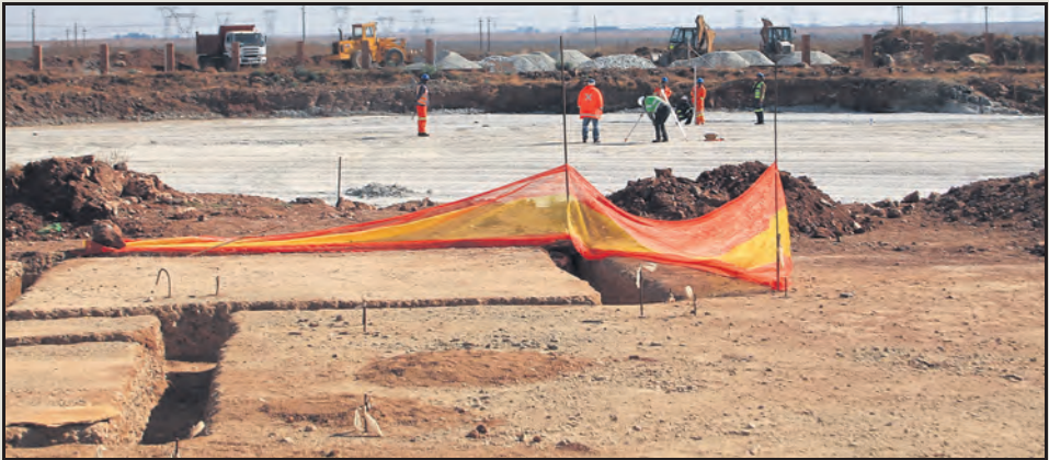
Despite the project starting as far back as 2016, there is still no sign of a new reservoir rising from the ground in Khutsong.

"The contractors first had to rehabilitate a sinkhole before they could build the reservoir. The approved completion date has been extended to the end of July 2020," a municipal spokesperson says. "The community liaison officer