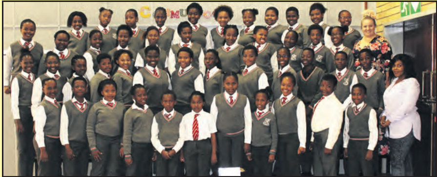
Above: Westfields Primary School's junior choir won gold and received a medal in the recently Carletonville Arts Festival.