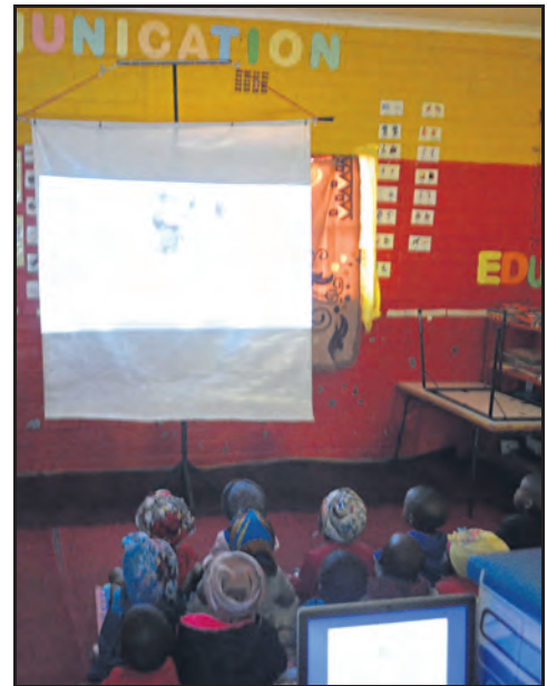
The children loved the movies.