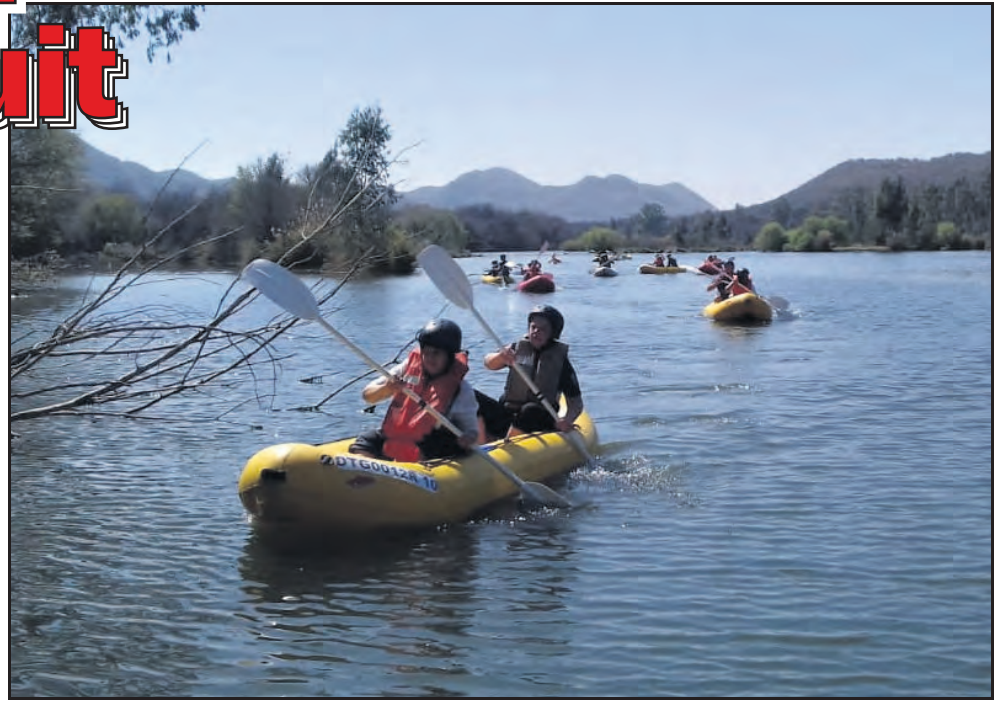
Witwaterroei was deel van dié deelnemers se avontuurterapie-sessie

"Wanneer 'n span byvoorbeeld hulle emosionele intelligensie wil ontwikkel, sal "pre-loading" behels dat die terapeut eers oor die belangrike komponente en vaardighede van emosionele intelligensie gesels. Daarna word die persoon aan 'n pasgemaakte aktiwiteit blootgestel, bv. 'n hindernisbaan, met die opdrag om te let hoe hulleself en ander mense emosies reguleer. Daar sal byvoorbeeld diegene wees wat dadelik die leiding neem en voorskryf hoe die hindernisbane aangepak moet word en ander persone sal weer verkies om na almal se insette