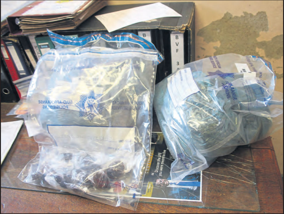
The police confiscated these bags of dagga, apparently destined for one of the schools in Carletonville, during the past week. In front are some dagga cookies.

found one in possession of a ziplock bag containing dagga. He swiftly arrested the suspect. In the third incident on the same day, a Carletonville schoolboy was arrested after police found dagga on him. The SAPS visited the school as part of a crime prevention operation and searched the first row of learners in a class. Afterwards, they randomly searched another child, who was sitting alone. The police found a ziplock bag of dagga in his possession. The learner admitted that it belonged to him and said he had bought it in Mohlakeng.