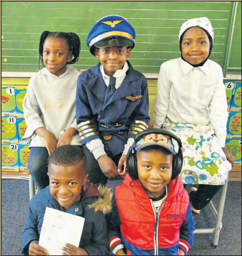
Westfields Primary School's Gr. 1s recently had to dress up as part of a careers day and show their teachers and friends what they wanted to be when they grow up.