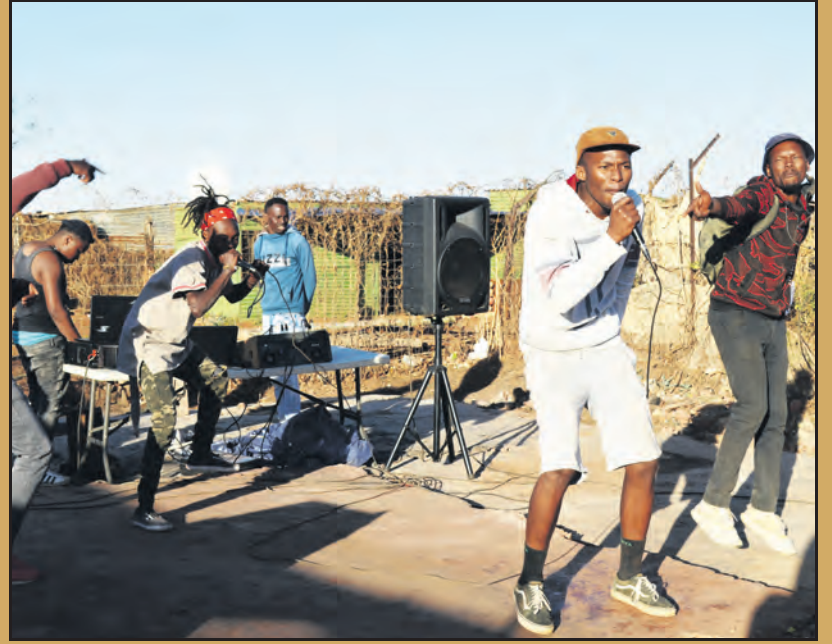
The enthusiastic artists entertaining the crowd.