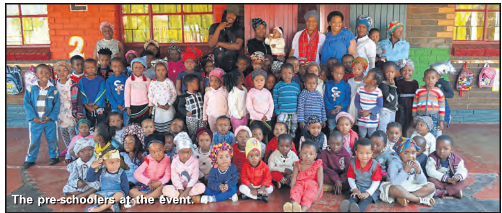
The pre-schoolers at the event.