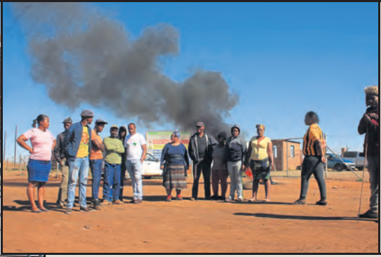
The residents showing their frustration at the project on Monday.

heaps of sand around and are paid millions to do it," a Khutsong resident previously remarked about the work at the Khutsong site. "Some people say these workers are getting 'grants' because they are not working for their money," another Khutsong resident remarked. The Khutsong project falls under the Gauteng Provincial Government and the Merafong City Local Municipality is responsible for the one in Fochville. The Herald asked Merafong why the project in Khutsong was so much slower.